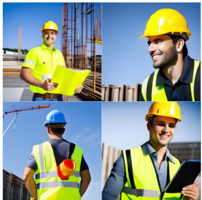
FIGURE 2: Images generated by Canva’s Text-to-Image using prompt “construction worker”