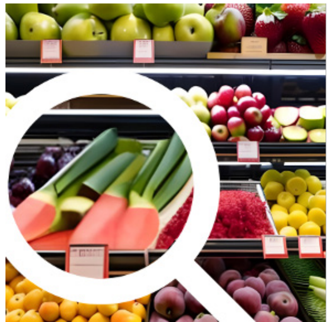
FIGURE 4: Example of hallucination generated in Canva’s Text-to-Image

depict a “watermelon” and avoid the term “shelf” altogether as in Figure 5.