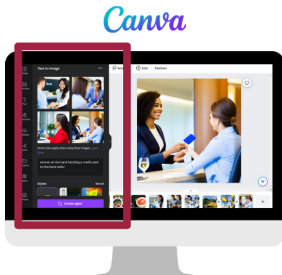
FIGURE 2: Screenshot showing Canva's Text-to-Image feature, outlined in red

Without GenAI, finding free images to create instructional materials or facilitate understanding in real time can lead to cumbersome internet searches, never mind the challenge of determining whether the image is in the public